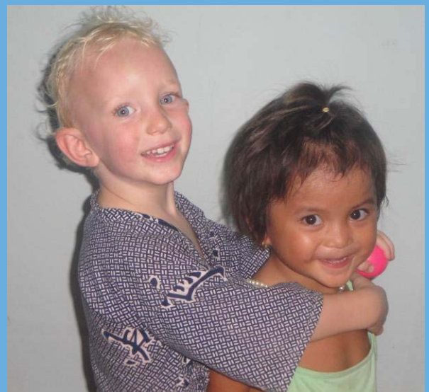
ONE OF OUR RECENT VOLUNTEERS