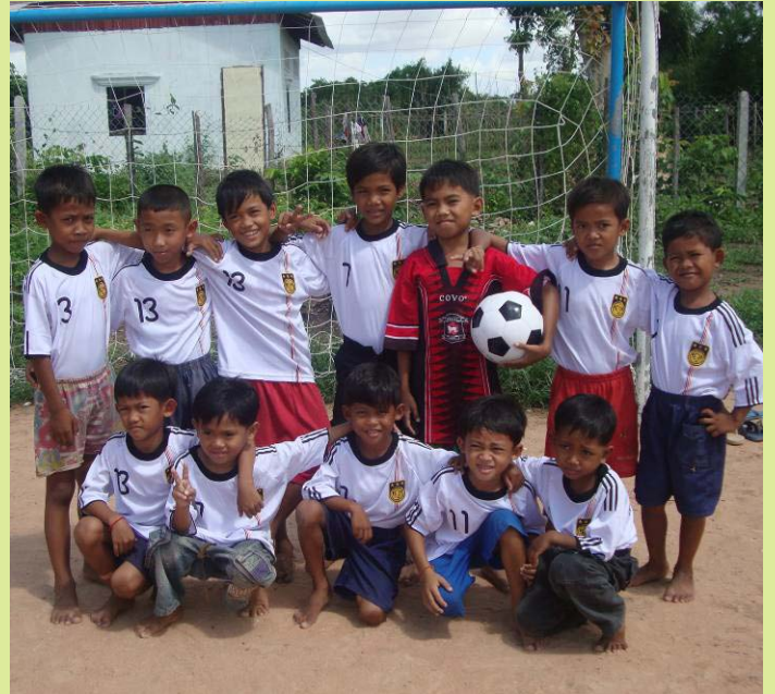
Our 'Kerry FC' team members

Our School loves football. The boys play, and the girls cheer. Have tried to encourage girls to play, but no, not or our girls!